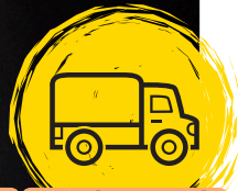
On the Road Program

A Physical Theatre workshop to empower students through the art of play and collaboration.