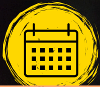
On Call Program