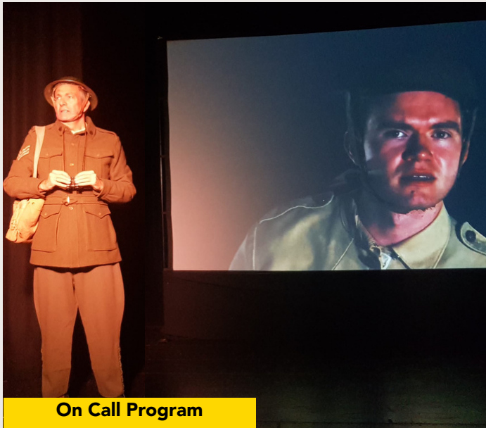
On Call Program

Australian History | Drama | Different perspectives