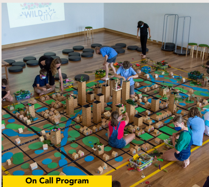
On Call Program

Bio-diversity | Sustainability | Urban landscape | Design thinking