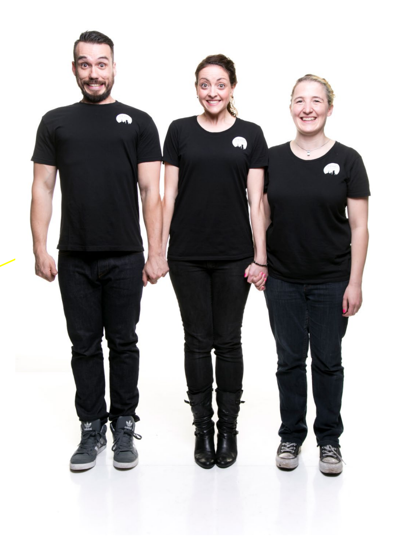
Page | 8 Regional Arts Victoria Teacher Resources are designed by the Programming team in collaboration with the artists. ©

The Recipe: The 'step by step' building blocks for story. Teachers can lead students through these stages to allow them to create a unique story all their own. Students can work individually or tell the story in groups.