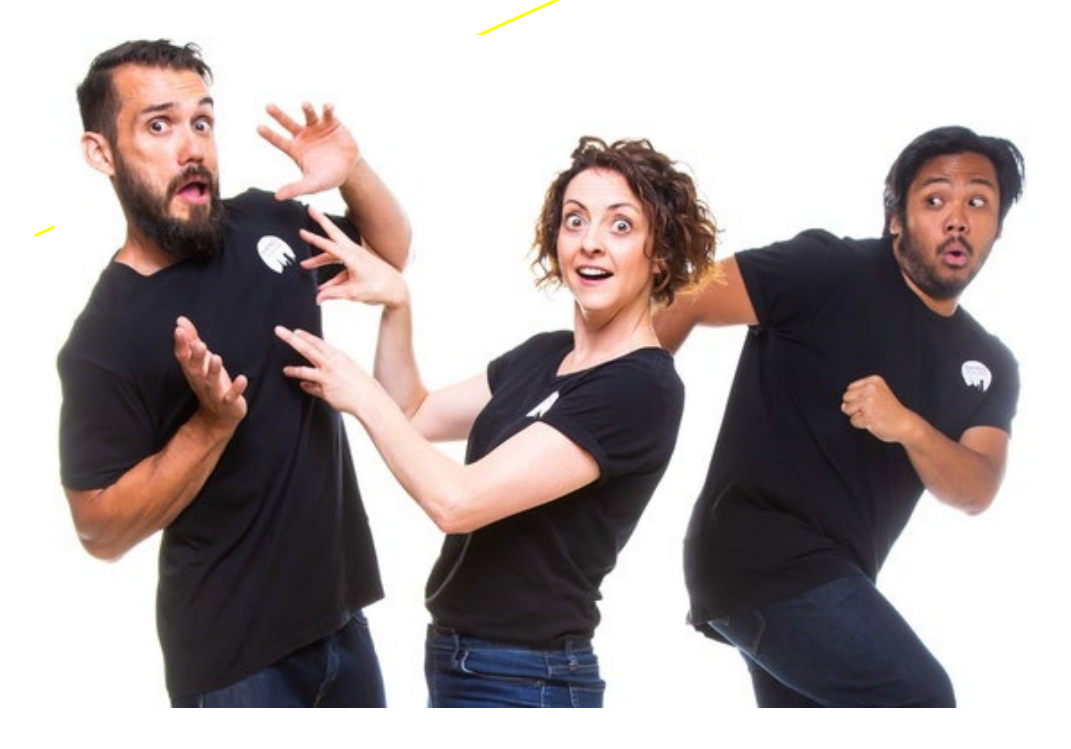
Page | 4 Regional Arts Victoria Teacher Resources are designed by the Programming team in collaboration with the artists. ©

The process is led by the performers, using the step-by- step recipe method and the How to Cook Up a Story handout. The three performers will become the characters the audience chooses. The audience are encouraged to add detail to characters with vocal, physical and emotional choices, which the actors take on and, through improvisation, create the story. Three to four stories are created in the show. The show includes a high level of audience participation through audience suggestions and student volunteers.