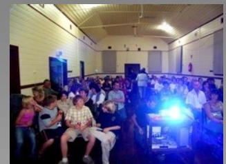
Big Screen Film Festival

The review includes a locality based presentation of findings whereby the Shire is divided into 10 districts, based on geography and community usage patterns. It presents cultural mapping information on each region including: community access to cultural facilities and activities; art, craft, heritage and cultural groups; community, sporting and educational infrastructure and service groups. There is then more detailed information on each facility including who owns and manages it; the amount of financial subsidy it receives from Council; and a comparison between arts and non-arts activity in the facility.