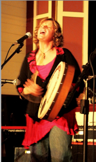
FevaPitch CD launch at Briagolong Hall