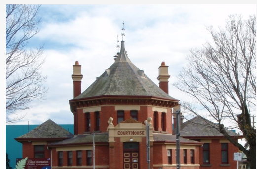
Yarram Courthouse Gallery

This comprehensive report will be presented to Council shortly along with recommendations drawn from it by the Manager of the Cultural Services Unit. Regardless of which options are taken up for action by Council the document will be a useful reference and planning guide for years to come.