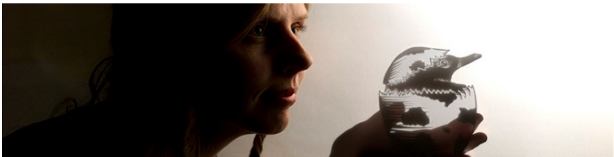
Spike by Little Wing Puppets. 2013-14 commissioned work. http://www.rav.net.au/arts-and-education/actf-commission

One of the most difficult things for me as a freelance puppeteer is carving out the time to create new work. Receiving the commission allowed me that space and the time to experiment."