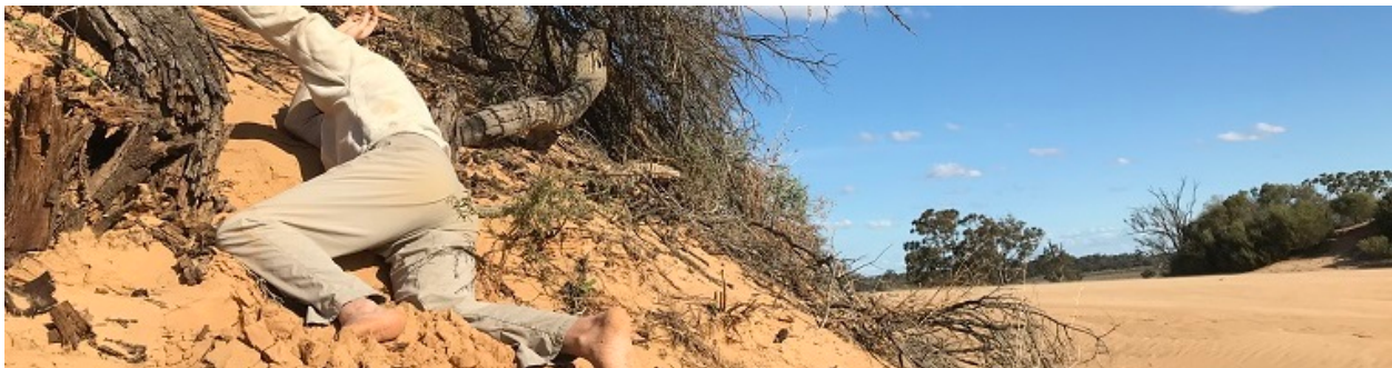
Body/Landscape Mildura workshop. Quick Response Grant recipient 2018. http://www.rav.net.au/funding-opportunities/regional-arts-fund