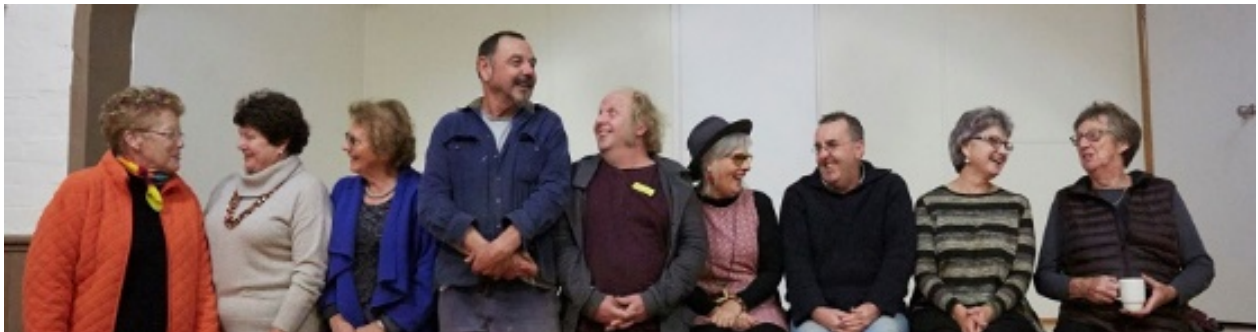
Creative Gippsland Come Play in May 2018.

Connecting Places is Regional Arts Victoria's community touring program supporting community presenters to develop their audiences and build arts participation.