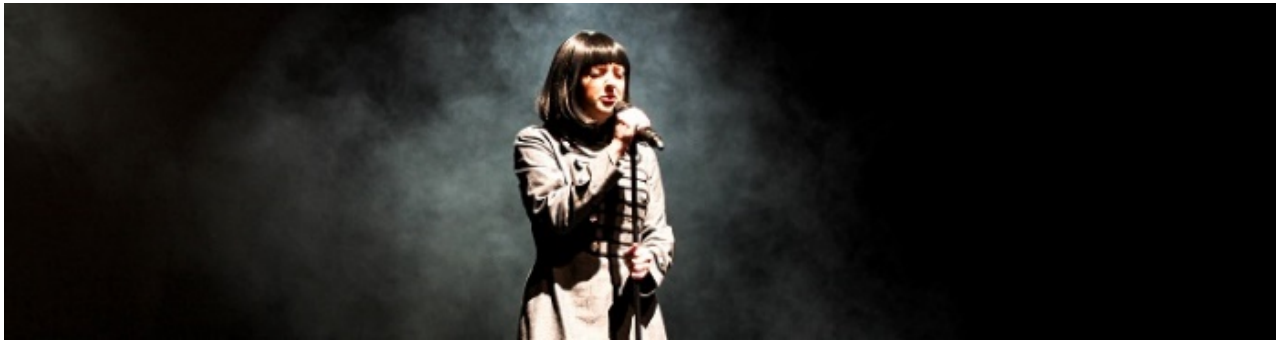
Lady Beatle by The Little Red Company and Critical Stages. Showcase Victoria 2018. https://www.showcasevictoria.com.au

Showcase Victoria is a collaboration between Regional Arts Victoria and the Victorian Association of Performing Arts Centres.